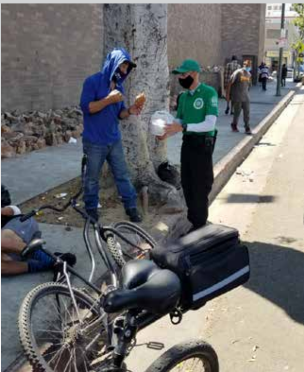
At times, officers will create hygiene kits and distribute it among the homeless population.