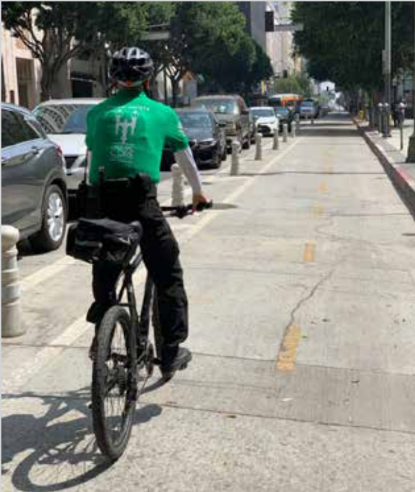
Officers enjoy walking the beat during farmers market.