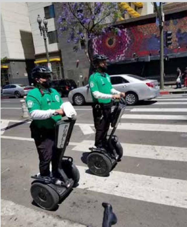
Officers can be seen patrolling throughout the district on foot, bike, segway, or vehicle.