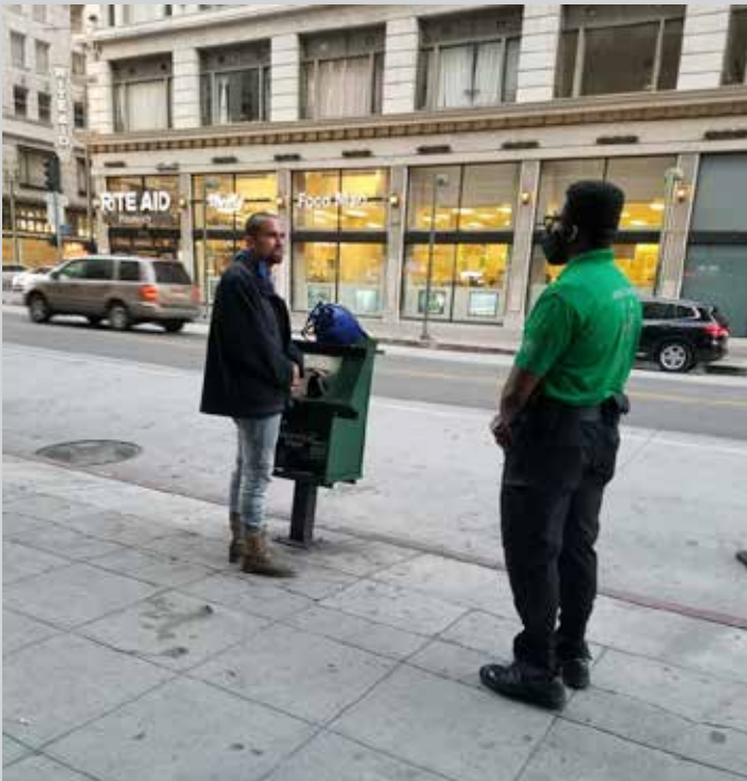
Social distancing is still encouraged in order to minimize the spread of COVID-19. 6 feet is the rule!