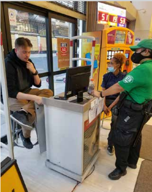
Officers also stay in constant communication with other security agencies in order to assure safety.