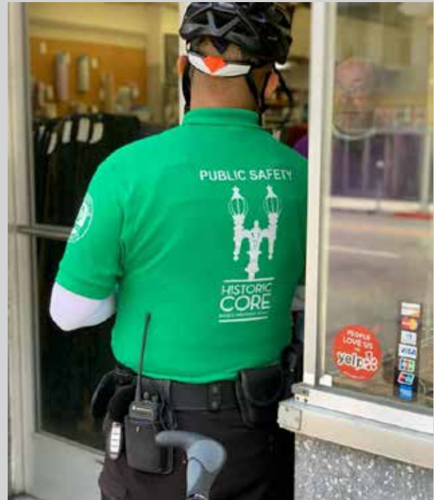
Our uniform presence helps deter crime in hot spot areas.